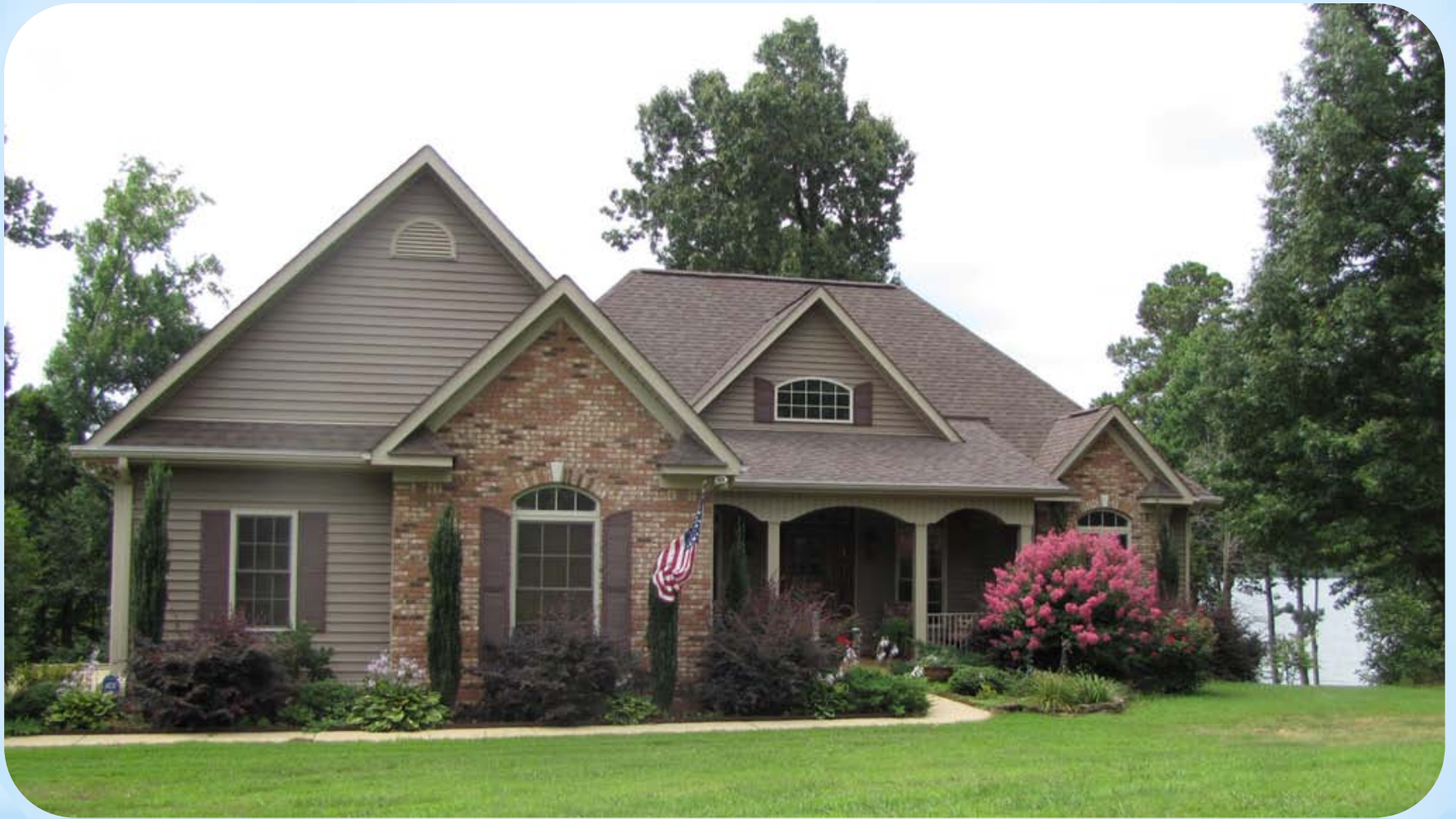
Home Front-1009 Buchanan Peninsula