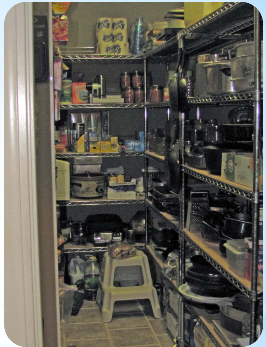
A screened porch for lounging while overlooking the water and a spacious pantry which every woman wants and needs. A breakfast room adds seating.