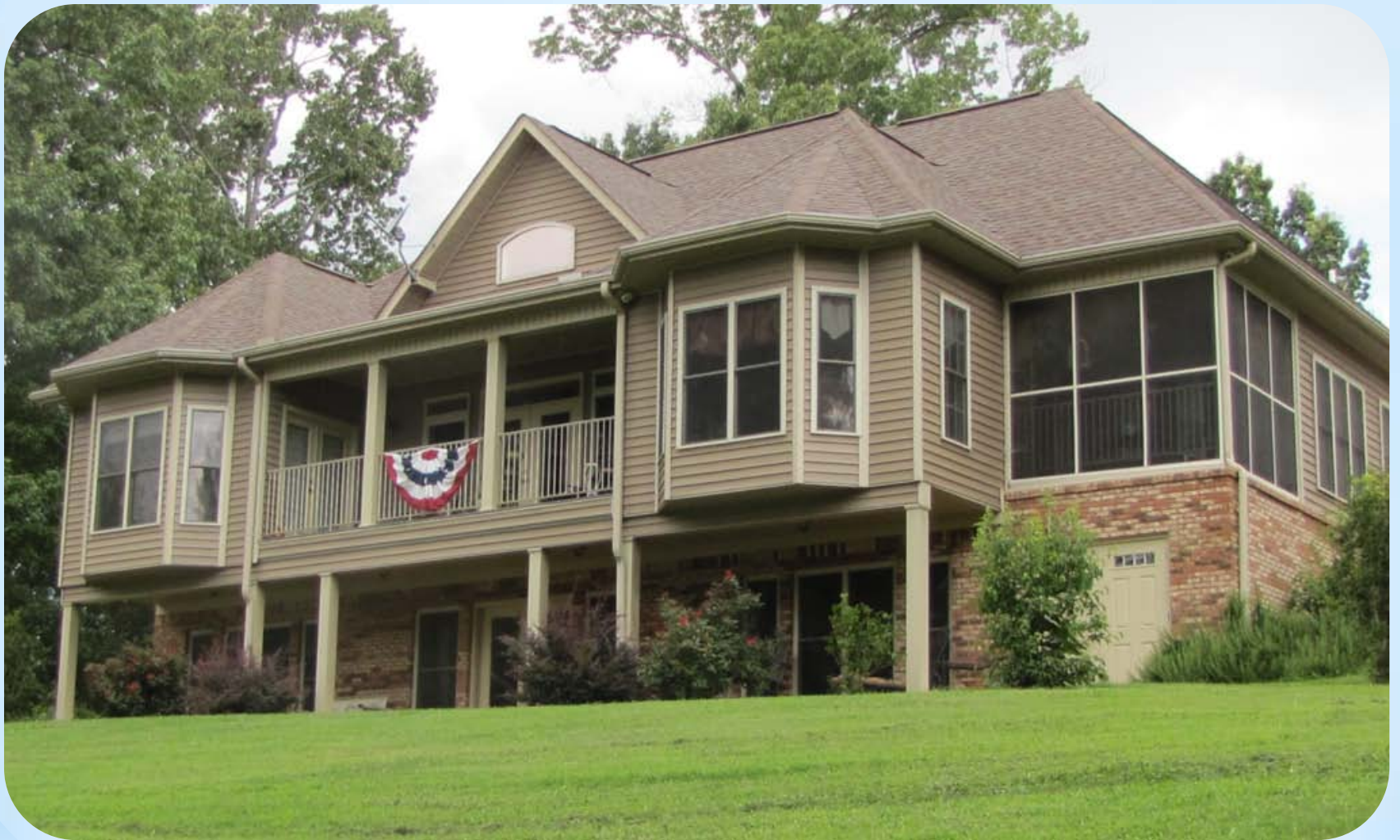
Overlooking Airplane Hollow on Bear Creek